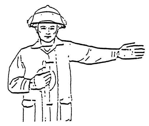
RIGHT OR LEFT

Point in the desired direction with one hand and motion in a circular "come-on" gesture with the other hand at the chest level. At night direct a flashlight beam at the hand pointing in the desired direction.