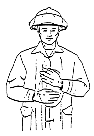
AHEAD OR BACK UP

Hold hand directly in front, chest high, fingers on hands directed toward one another, and motion in a circular "come-on" gesture. At night hold a flashlight in one hand and direct the beam toward the other.